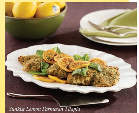
Sunkist Lemon Parmesan Tilapia